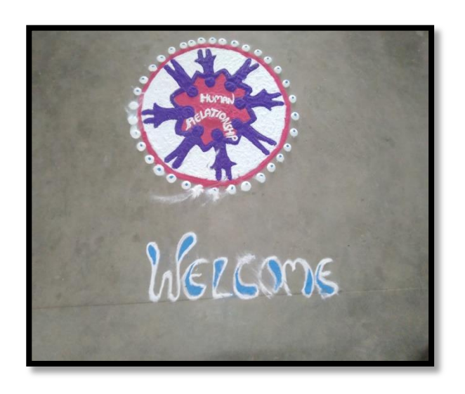
Welcome Rangoli by students