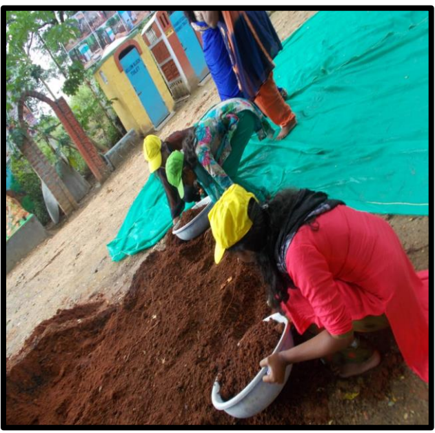
Seeds are being planted in the sand packets and filling in of the sand by the students