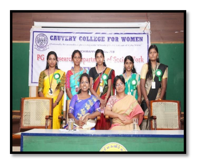
Office bearers of Amity Club with Resource person and Club co-ordinator