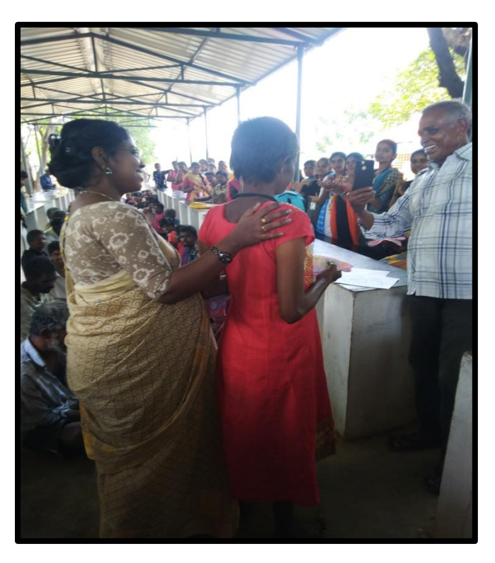
The inmates of Anbalayam are being felicitated for their wining in competitions hosted by students